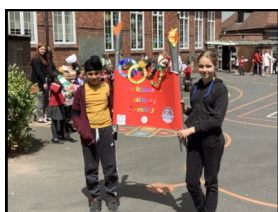
Olympic Torch Relay