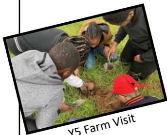
Y5 Farm Visit